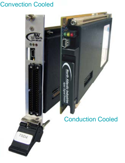
User Signals (Via Front Panel or Rear P2 Connectors)