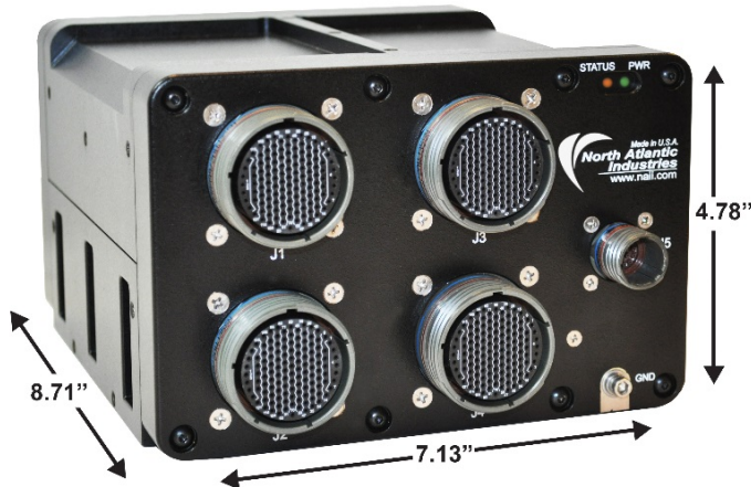
Mix-and-Match Modular Architecture

The SIU35 is a highly configurable rugged system or subsystem ideally suited to support a multitude of Mil-Aero applications that require high-density I/O, communications, Ethernet switching and processing. The SIU35 leverages NAI's 3U boards to deliver off-the-shelf solutions that accelerate deployment of SWaP-optimized systems in air, land and sea applications.