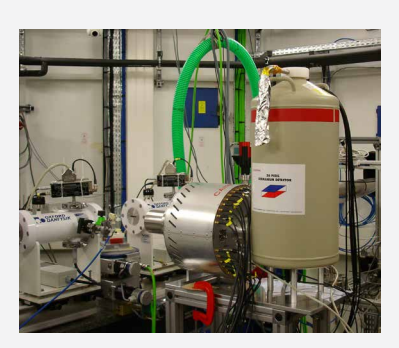
36 pixel detector for EXAFS at Soleil Synchrotron