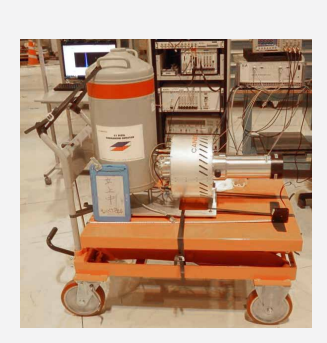
25 pixel for EXAFS at Spring8