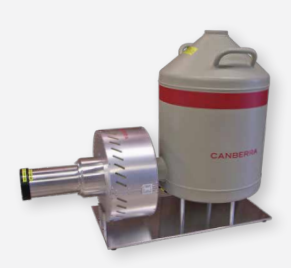
64 pixel detector in a horizontal cryostat design