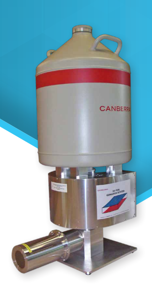
100 pixel detector in a vertical cryostat design

EGPS series is the best choice for X or gamma ray measurements in many applications such as Physics or Astrophysics experiments.