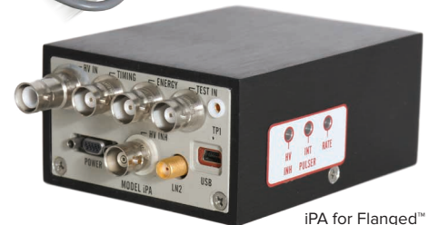
iPA for Flanged™ Cryostats