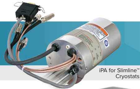
iPA for Slimline™ Cryostats